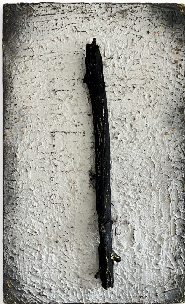
Will We Ever Be As Close As These Two Pieces of Wood? 43x72x3cm